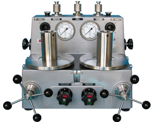
Model CPB6000DP differential pressure balance

The comparison element is then isolated and the mass equivalent to the differential pressure increment required is added to the measuring piston. The pressures on both sides are adjusted using the variable volume. Note that this procedure compensates for any diaphragm movement within the instrument under test.